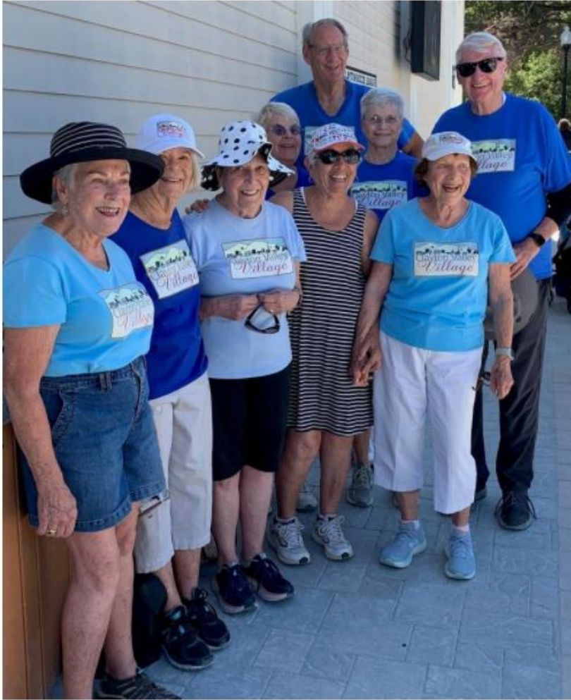
CVV 2021 Summer Bocce League Team. They play every Sunday at the Ipsen Family Bocce Courts through October.