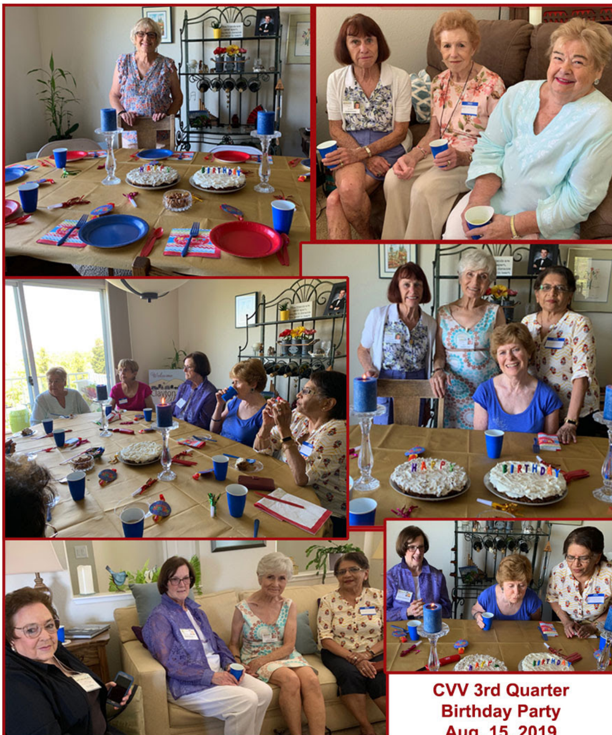
CVV 3rd Quarter Birthday Party Aug. 15, 2019