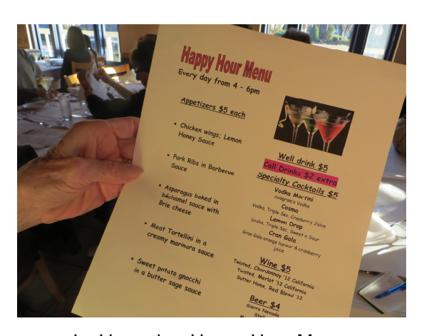
La Verandaos Happy Hour Menu.