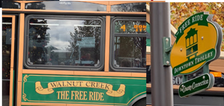
Passing up the Free Trolley Ride and Enjoying Lunch at Boudin's.