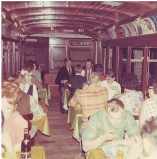
First trolley car dining area in the Portland location.