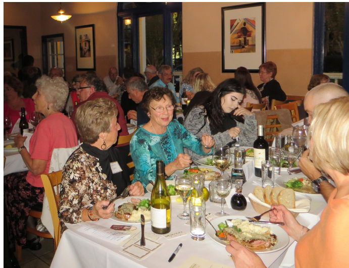
CVV backers at last year's Sunday Supper.

Following up on the success of last year's fundraising event, Clayton Valley Village will hold its second annual "Sunday Supper and Silent Auction," at La Veranda in downtown Clayton on September 27 from 5:00 to 9:00 p.m.