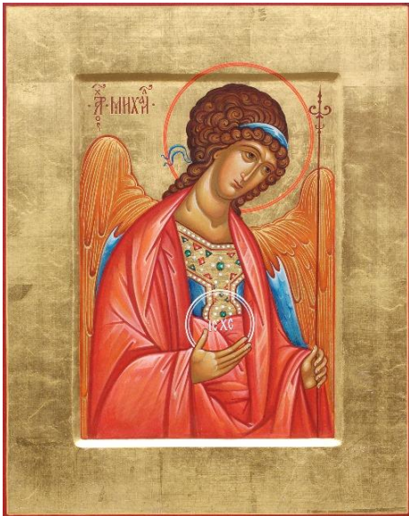
Traditional icon from the Vassilevsky Monastery in Suzdal, Russia.

Icons in Transformation showcases the paintings of Russian artist Ludmila Pawlowska in only Bay Area appearance.