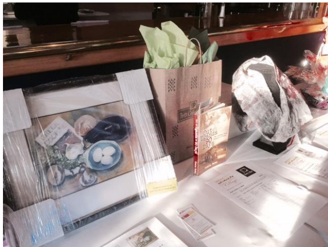
Some of the items going up for bid.

The event raised $2,495 which will go toward the official launch of Clayton Valley Village on May 1, 2017.