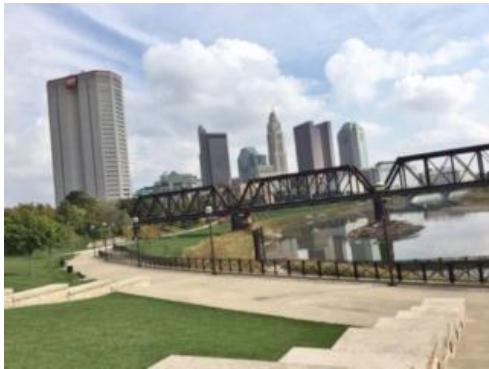
Downtown Columbus, Ohio, at the confluence of the Scioto and Olentangy rivers. (There will be a test.)

The 8 th Annual National Village Gathering brought more than 250 village members from all over the U.S. to Columbus, Ohio, October 17-19. Three Contra Costa villages sent representatives for the opportunity to gain and share valuable information, network with other villages around the country, and learn from each other's experiences.