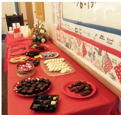
Coffee and cookies. Thank you, Events Team and Peet's Coffee!