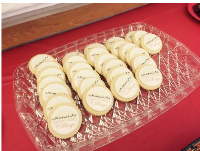
Cookies with CVV logo by Arlene Lewandowski