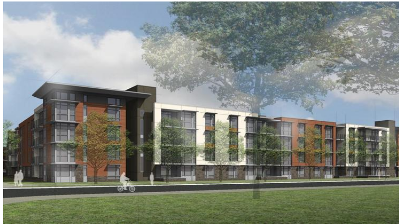
Architectural rendering of Viamonte facility planned for Walnut Creek. Cost of a 2BR unit is estimated at $320K, plus $500 monthly fee.

According to the San Francisco Business Times, a total of 174 units in the projects will have condo-like finishes and operate as a Continuing Care Retirement Community, where residents pay an initial fee and monthly dues to pay for services including housekeeping, maintenance and assisted living. Another 20 units will be assisted living and memory care units. About 80 percent of the initial fee is returned if the resident leaves or passes away.