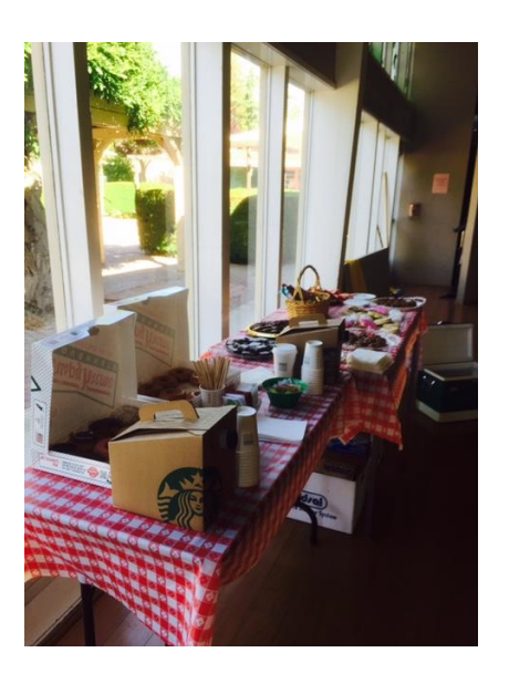
And, yes, there were refreshments.