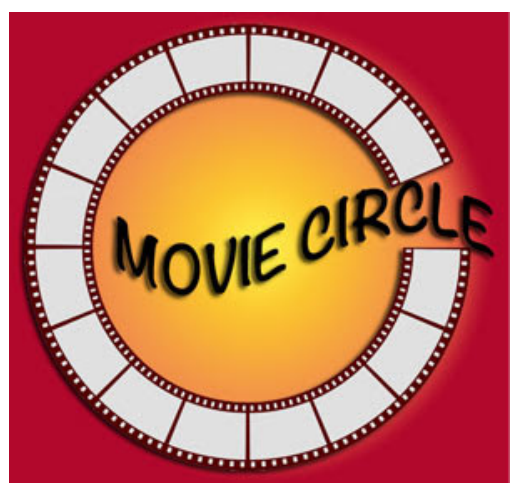
Movie Circle Activities

only to members. Examples of Open Circles are: Movie Circle, Bocce Ball Circle and Reading Circle. Examples of Closed Circles are Book Club, Bowling, Creative Writing Circle.